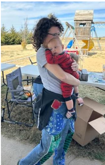
And then there's those moments of perfect peace.