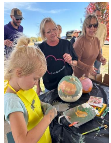
Hmm... are we painting pumpkins or our faces?