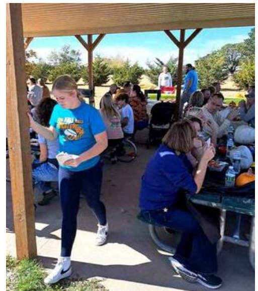
Adults, youth and members of the confirmation class joined in the fun.