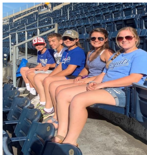
FUN IN THE SUN AT THE ROYALS GAME

On Friday they volunteered to help at a thrift store called "Blessing Abounds Thrift Store". They headed home for Marquette after a busy day helping others.