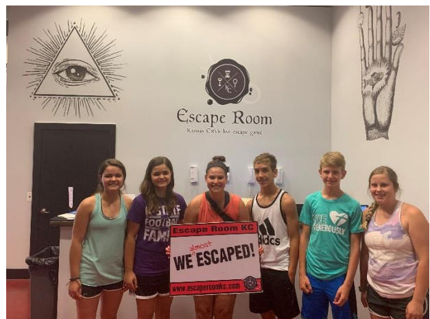
We ALMOST escaped from the Escape Room!!

SEE "YOUTH NEWS" PAGE FOR HIGHLIGHTS OF THE YOUTH GROUP TRIP TO KC IN JUNE