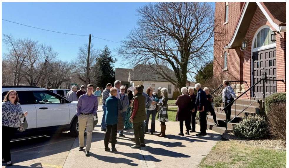
Below: Church members gather after Sunday worship service to visit with each other and enjoy the sunshine and fellowship.